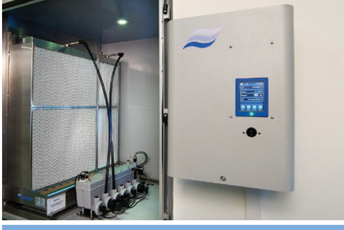
ME-Series Media Evaporative cooling and humidification

Nortec also offers a wide range of associated products such as water treatment systems, air compressors, pumps and humidity monitors.