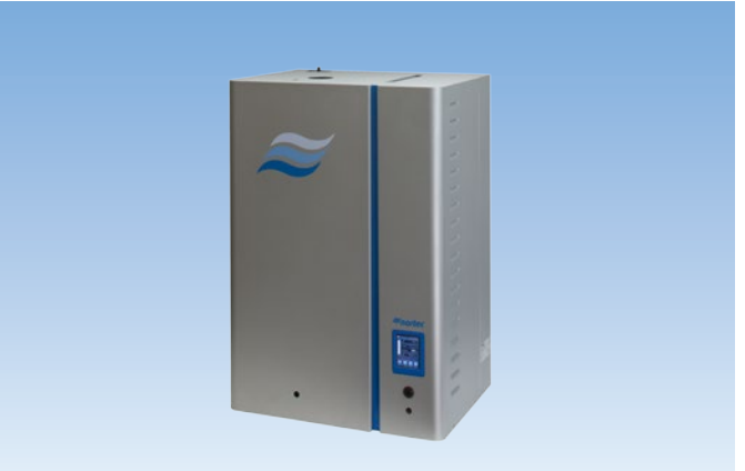
GS-Series Gas-fired steam humidification